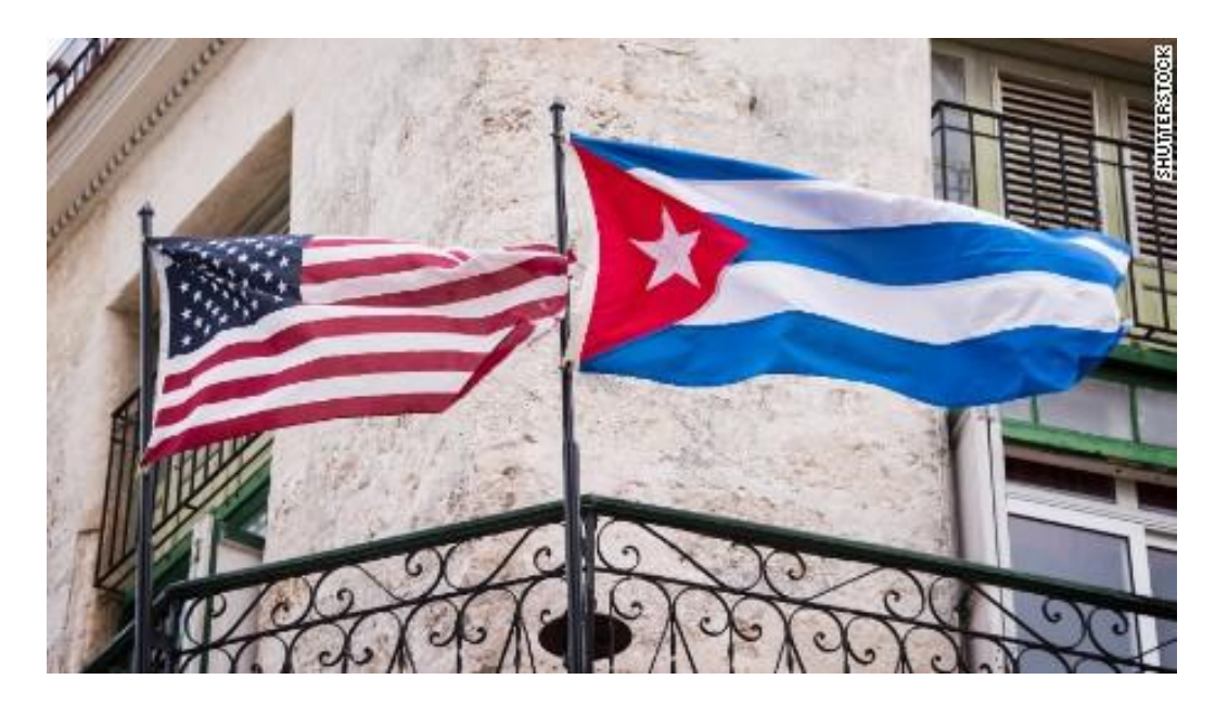
US and Cuba have long history of undiplomatic relations

In 1977, the United States and Cuba took the first step toward restoring diplomatic relations by opening interests sections in each other's capitals, and US diplomats moved back into their seafront offices.